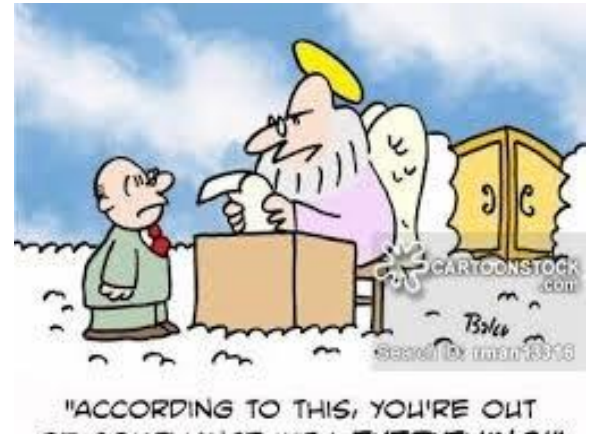
ANCE WITH EVERYTHING!"

While FEMA contraventions are dealt with under the civil law procedure and the Reserve Bank of India (RBI) is authorized to compound contraventions under all the sections, except contraventions under Section 3(a) of FEMA.